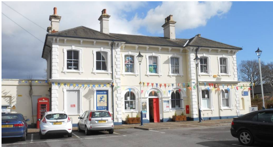
Netley station

Another date for your diaries: the AGM is on 11 th February 2019.